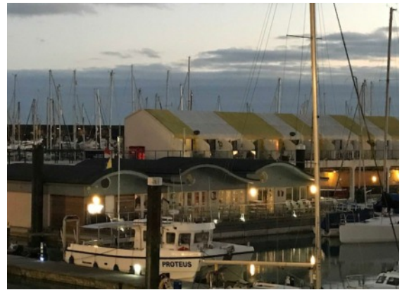
Evening at the club

Happy New Year to all our members. Hope you enjoyed the festive season. The club is planning its programme for the year - social highlights are on p3. Our sailing calendar for 2019 is underway (p2). Details of the membership structure and subscriptions for 2019/2020 are on p4.