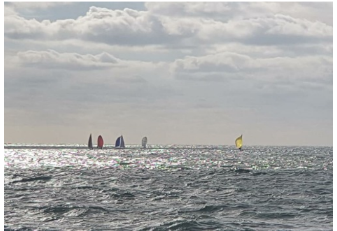
Views from the arm. Thanks Kevin

tide, turning upwind toward BMYC 3 before a very deep kite leg back to BMYC 1. The tide played a big part in gybe and upwind headings as everyone was swept East. Heading on to BMYC 2 before tacking back to BMYC 3, the race finished at the marina arm and BMYC 1. Well done to Imadjinn in third place, Joustier in second and Diamonds4Ever in first, making it her second IRC win in as many weeks. Great effort!