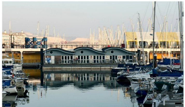
A great photo of the club