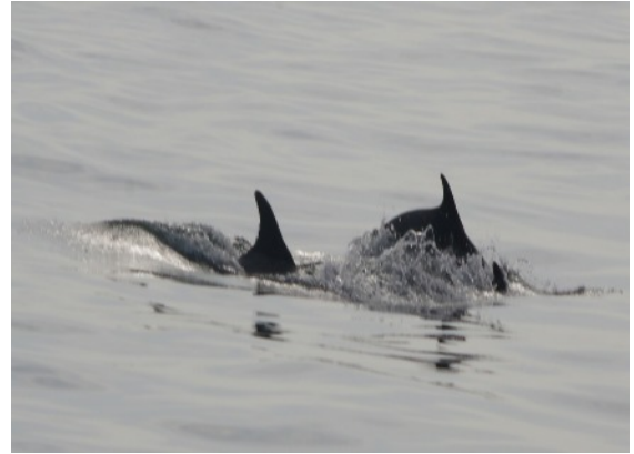
Dolphins came to visit Club Class one Autumn morning