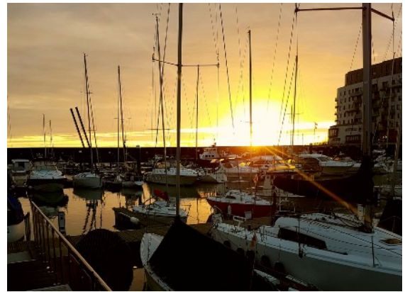
Ryan's sunset picture

Wow, November sure provided us with some weather to remember.... Stormy seas and beautiful sunsets. The last two weekends have been too stormy for racing... hoping for fair winds and good waves this weekend so we can get on with our Winter series.