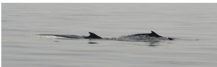
Dolphins visited Club Class one Autumn !

A log of all water-based activities is kept during each watch and, when requested, weather conditions can be passed to yachtsmen and fishermen before they put to sea. Also with the new generation of web cams they can identify sea conditions for those who wish to check on the weather or sea state prior to doing any watersport activity, hopefully reducing the need for HM Coastguard response and RNLI callouts. During each watch other activities such as canoeing and diving etc are closely observed, as are bathers, walkers and climbers who use the shoreline.